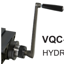
VQC-125HFV HYDRAULIC TYPE